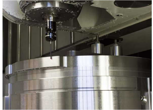
Intoco use Renishaw probing systems to measure large components during the manufacturing process

"Currently the metals extrusion industry commands 50% of our production capacity, but we also manufacture components for the oil and gas, green energy and pharmaceutical industries", says Wayne Parkins, Intoco's CNC Production Development Engineer. "We purchased the Mazak Integrex e-1850V to machine very large critical components up to 2300 mm in diameter and 1500 mm in height, manufactured in Alloy C22, super duplex and high alloy pre-hardened tool steels. With our clients not allowing any possibility of 'weld repair' in the event of a mistake 'right first time' on 1 off components is critical with no margin for error.