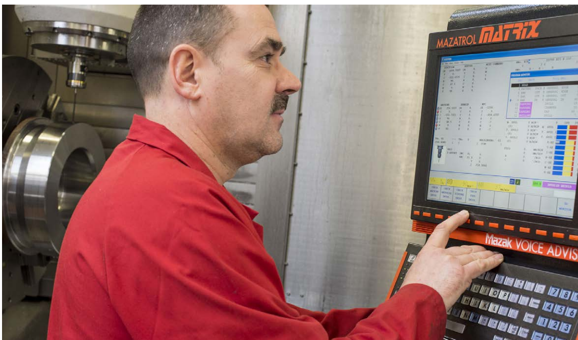
Intoco uses Renishaw's machine tool probing systems on its Mazak INTEGREX machine tools