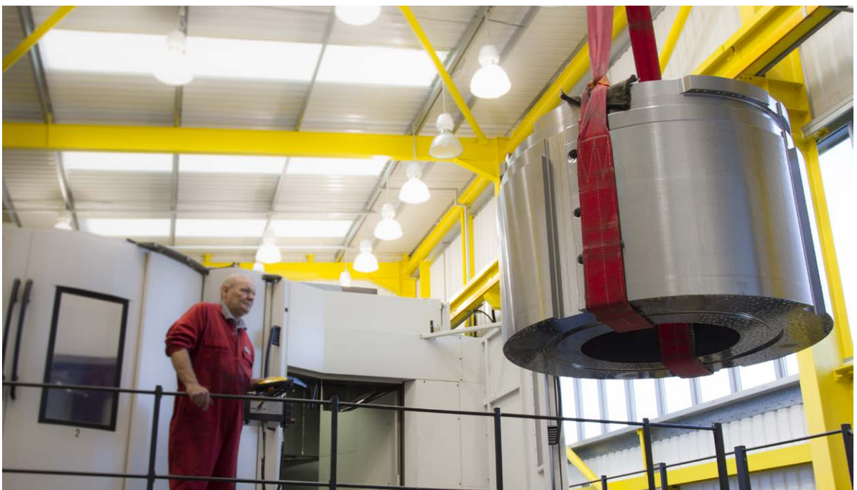
Intoco uses a Mazak INTEGREX e-1850V to machine components with large diameters

"Inspection Plus is great because you can do in-process measuring and adjust tool sizes automatically with the controller, so from a measurement perspective it takes a lot of problems away from the operators", explains Mr Parkins.