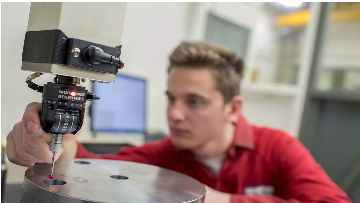
Intoco also uses the Renishaw MH20i manually adjustable probe on its co-ordinate measuring machine