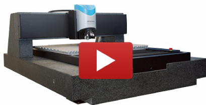
The new video of InfiniteFocusXL 1000