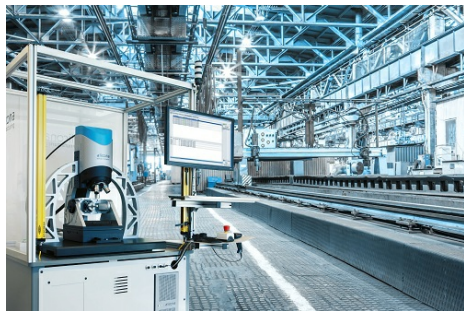
From lab to production: The fully automated measurement system InfiniteFocus G5